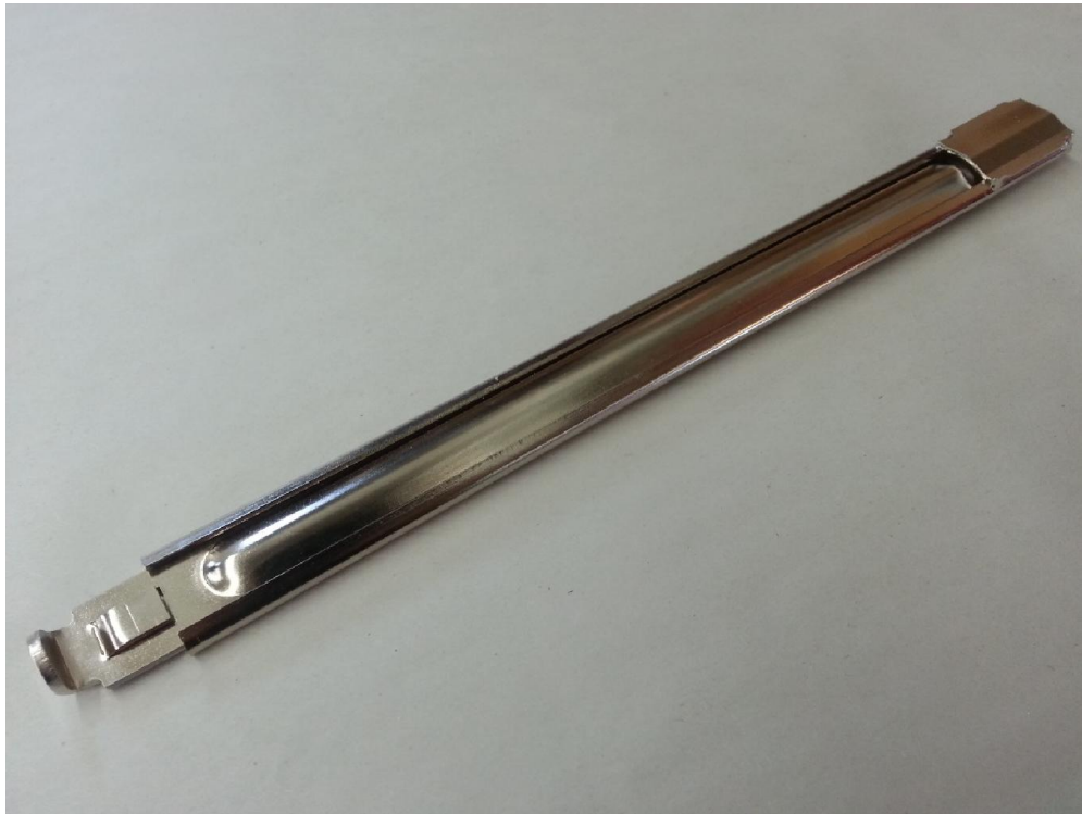
Photo 3: C-207 Cargo Door Up-Latch (Cessna PN 1213922-1)