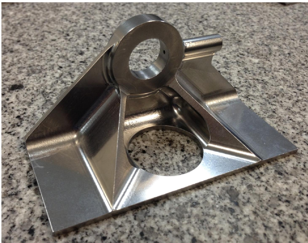
Photo 1: Fully Machined Stabilator Hinge Bracket for Helio H-295 Courier