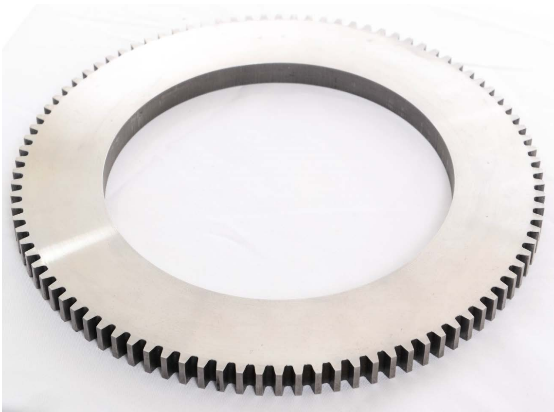
Airforms, Inc. brake disc for CASA 212-200 aircraft